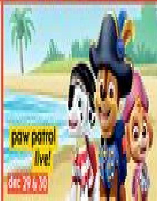
paw patrol live!