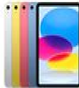
iPad (10th generation)