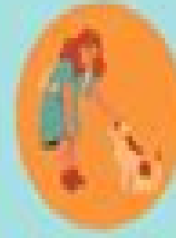
Spending Time With Pet & Animals