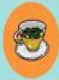
Drinking Herbal Tea