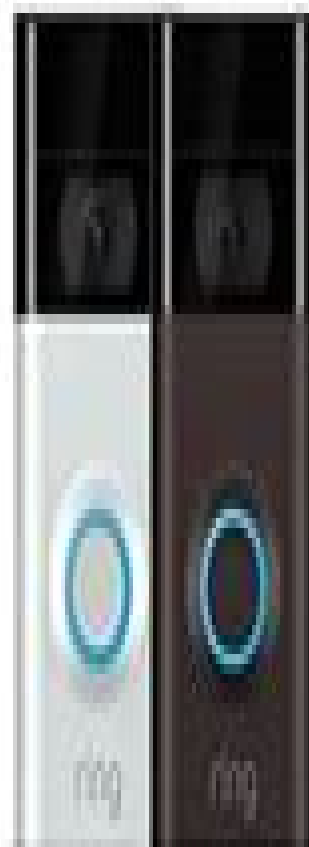
Ring Video Doorbell 2