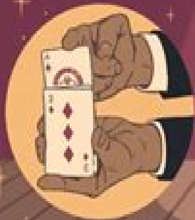
The Rising Card