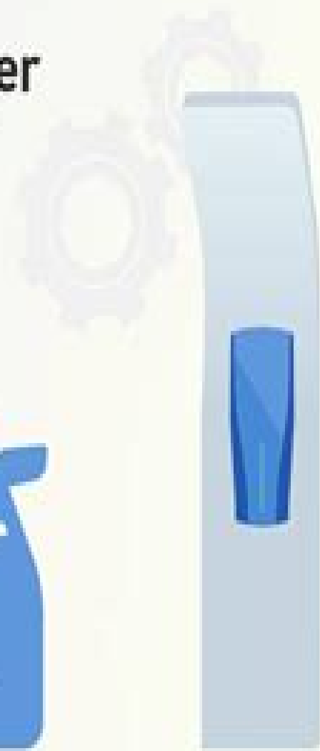
AC EV Charger