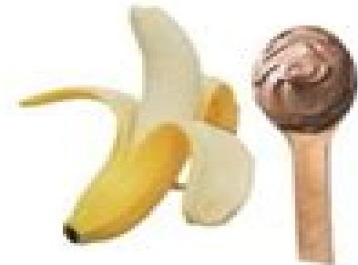
Banana + hazelnut spread (carb + fat)