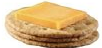
Cheese + crackers (fat + carb)