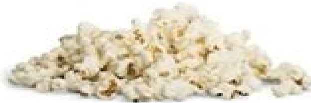
Popcorn (carb + fiber)