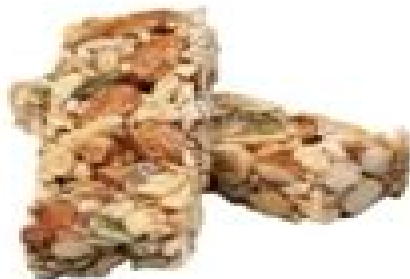
Granola bar (carb + protein)