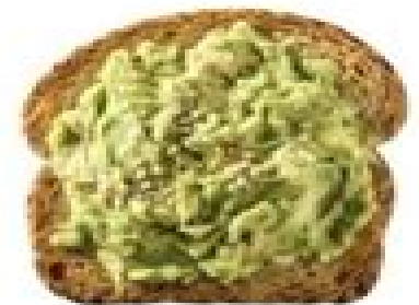
Avocado toast (carb + fat)