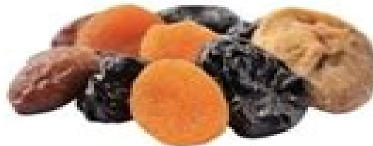
Dried fruit (carbs)