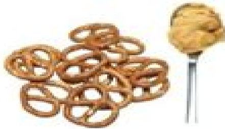
Pretzels + PB (carb + fat)